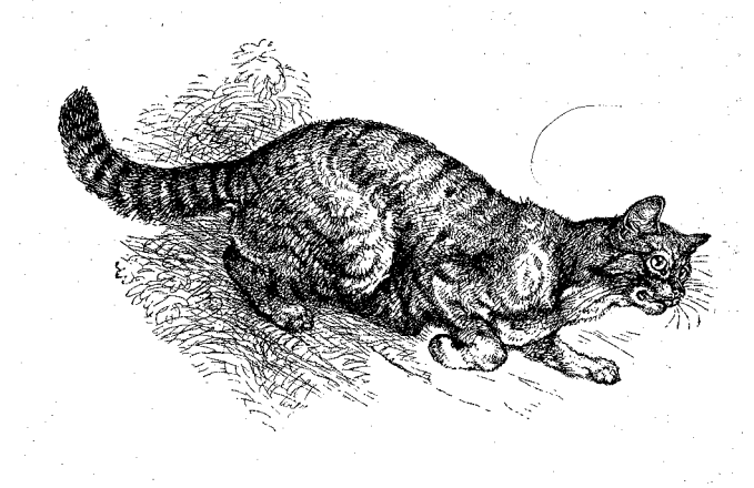
WILD CAT, BRITISH MUSEUM.

much time in watching cats that were roaming beside streams and about ponds, there has never been even an attempt at "fishing." Frogs they will take and kill, often greedily devouring the small ones. Yet doubtless they will hunt, catch, and eat fish, for the fact has become proverbial.